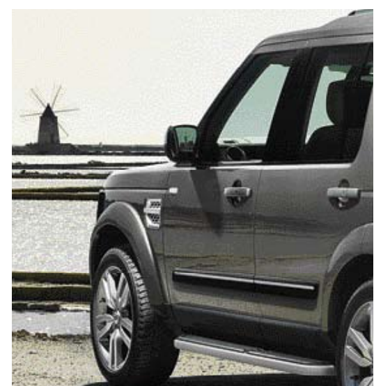
Fixed Side Steps and Body Side Mouldings with Bright Insert